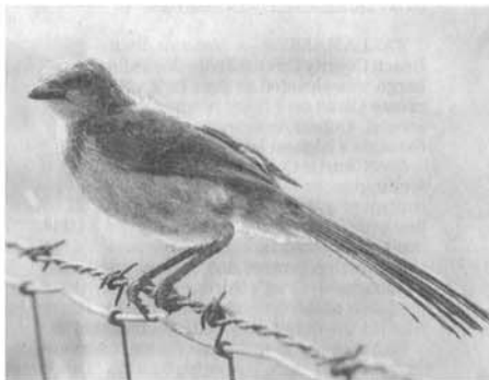
A fledgling scrub-jay sits on a barbed-wire fence in May 2007. The federal government lists the species as threatened.